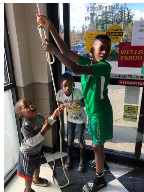
About a hundred people rang the bell before we broke the rope!