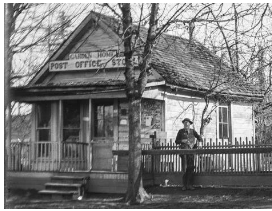
Postmaster Lumen Nichols, 1890