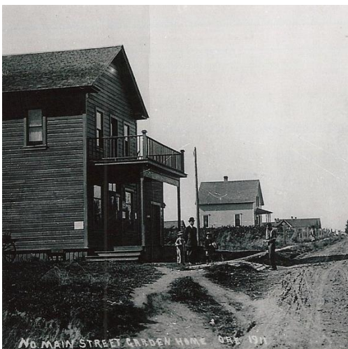
The Red Store circa 1911