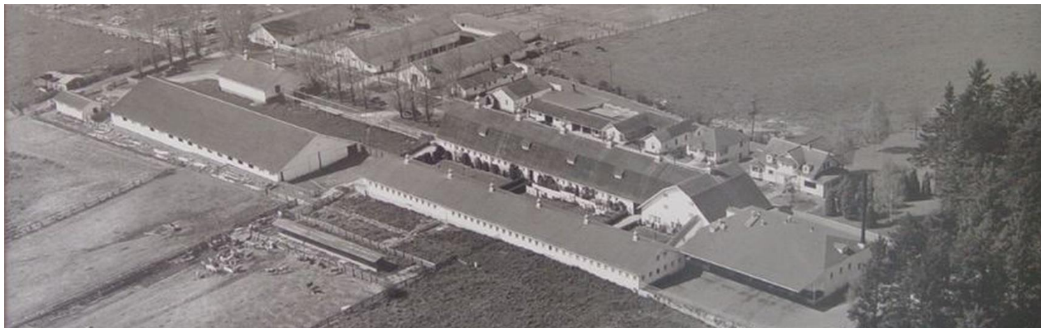
Alpenrose Dairy (date unknown)