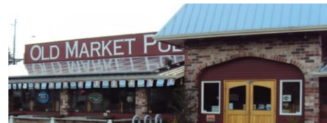
Old Market Pub, 2017

Virginia Vanture presented our February program on the beginnings of the Cooperative Cannery in Garden Home, 1944 (now the Old Market Pub). The Cannery responded to the war time rationing, food going to the military and Victory Gardens; in addition to the concern after the Great Depression to preserve food for one's family. Garden Home's large platted lots and fruit trees provided an abundance of produce.