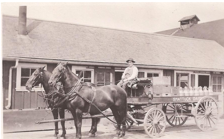
Shattuck Dairy wagon