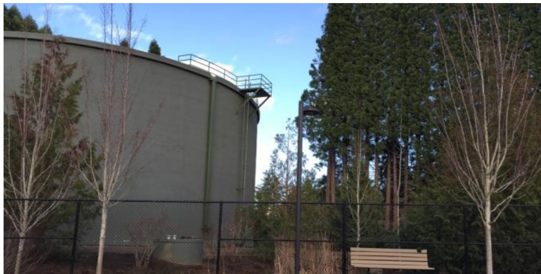
Closely planted Sequoias by the TV Water District tank on SW Garden Home Rd