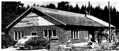
Cooperative Cannery 1945