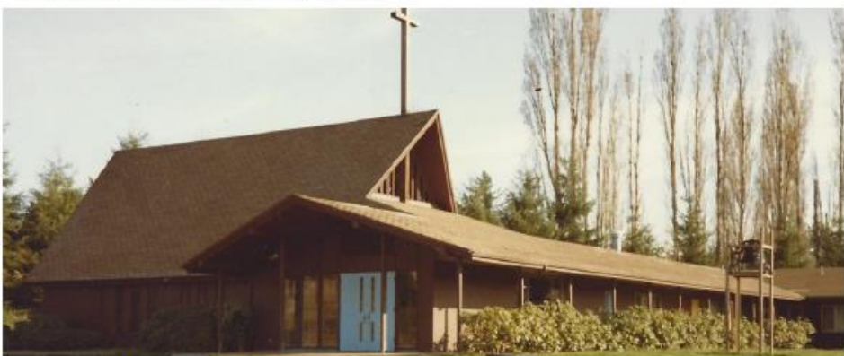
Garden Home Methodist Church at SW 81st Ave and SW Garden Home Rd.