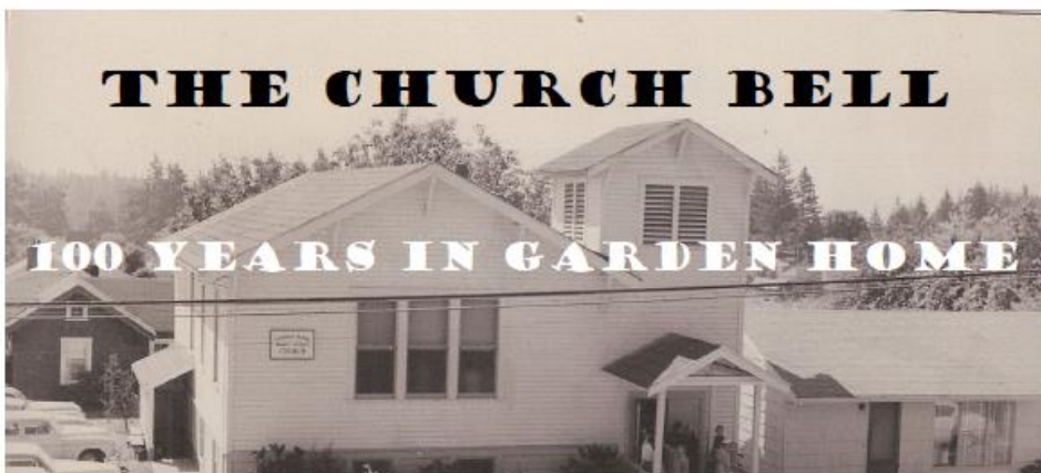
Old Community Church at SW 71st Ave and SW Garden Home Rd

Visit GardenHomeHistory.com for over 150 stories and 1000 photos.