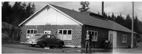
Whitney's Cannery, 1950