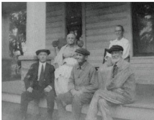
TE Hills and others