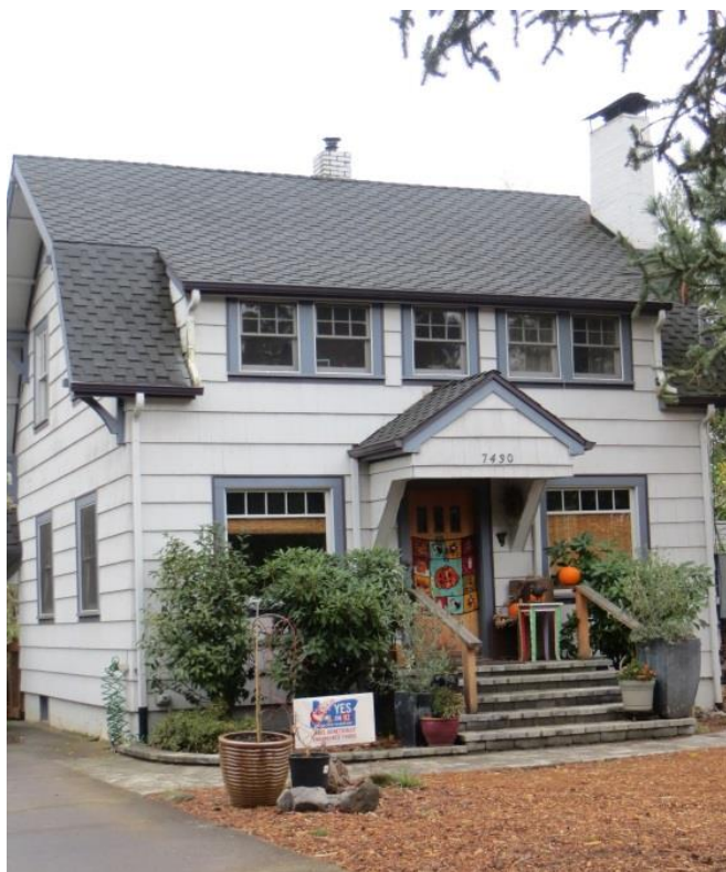
7430 SW 76th Ave (built in 1915)