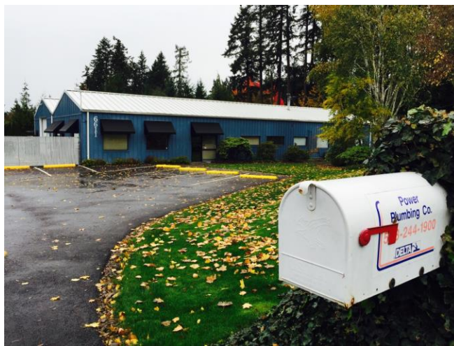
Power Plumbing on SW Multnomah Blvd, 2016