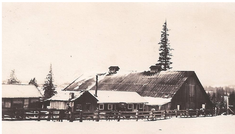
Gertsch barn off Oleson Rd in today's Arranmore development