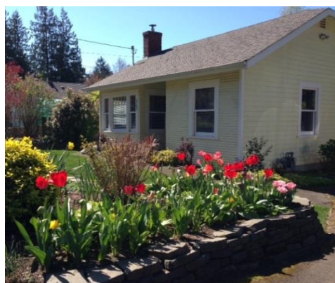
Original Godwin house