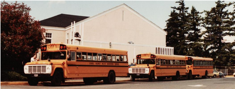
Last day of Garden Home School, June 1982

Thanks to all of you for your interest, your stories, and your contributions.