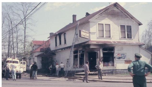
Wilson's Grocery burned in 1956