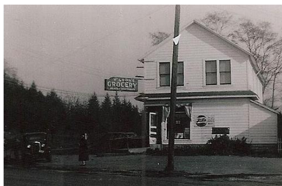
Wilson's Grocery (aka The White Store)