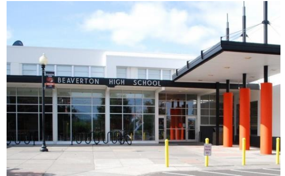
Beaverton High School

REUNION! Join us on Saturday morning, August 13, 10AM to noon for our REUNION of Garden Home School and Beaverton High School graduates and friends. We'll meet outside in back of the Garden Home Recreation Center at 7475 SW Oleson Road (the old Garden Home School). We'll be in the covered area near the playground, near the first northern parking lot. Free. Meet old friends, refreshments, enjoy historic displays, photos and a short program at 11AM. Please bring any old photos or mementos of you or your family in Garden Home that we might scan into the computer and return promptly to you. Please send this invitation out to your classmates!