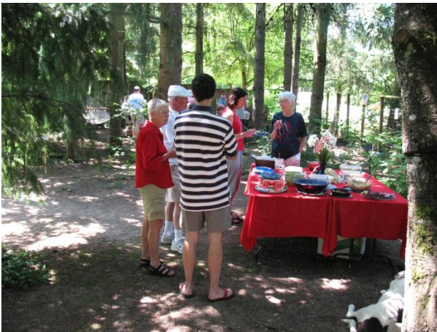
4 th of July picnic